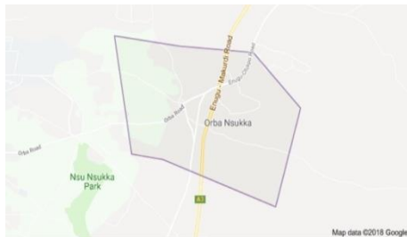
Orba in Udenu LGA